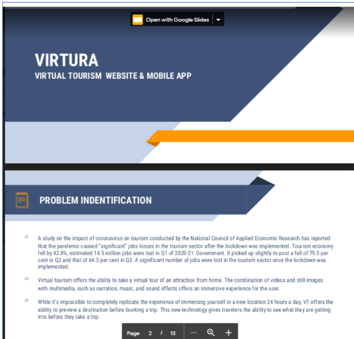
Fig. 2. About Idea