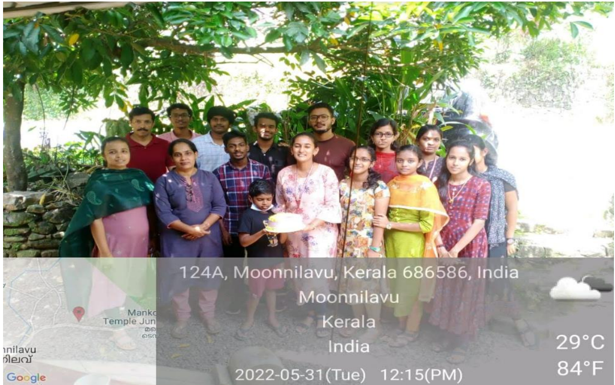
Workshop related photos

Number of participants: 12 members participated in cake making